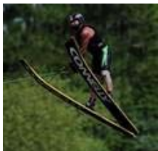
Ski Championships Saturday