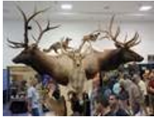
The Big Buck Expo