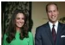
Will and Kate's California Visit