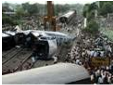
Train Derails in India, Kills Dozens