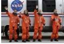
Space Shuttle Atlantis last launch