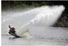
Ski Championships Sunday